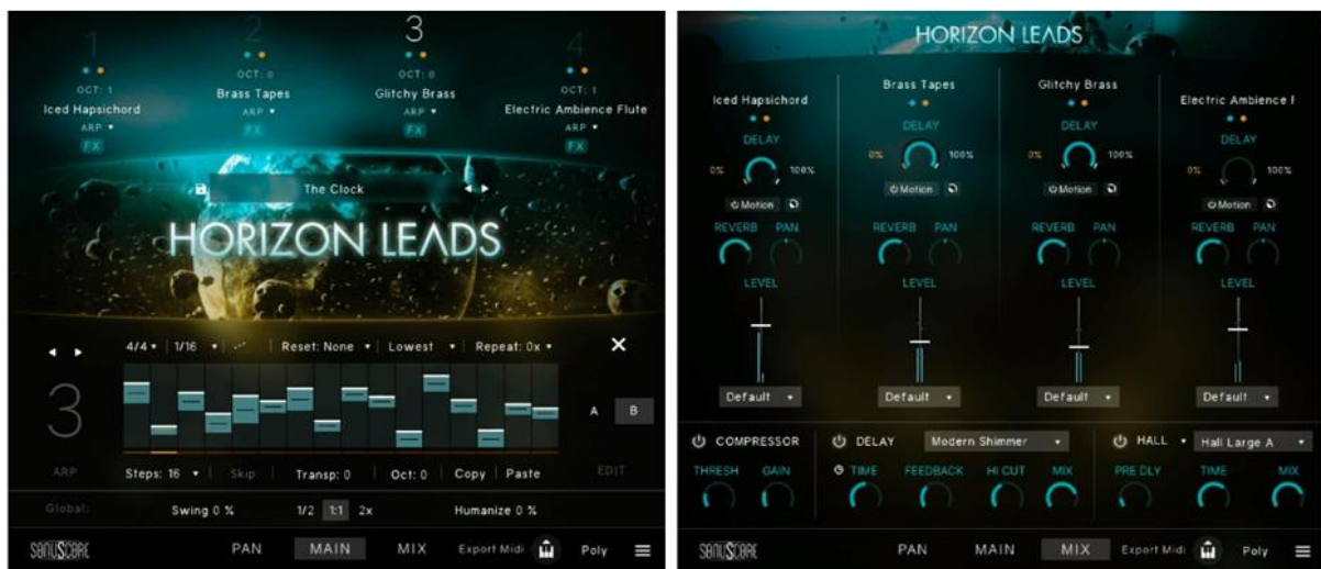
Ensemble Engine & Mixer GUI

Motion Engine: Horizon Leads comes with its own unique dynamic FX engine. It allows the fundamental customization of the instruments, e.g. steering attack or decay via Midi CC. Besides other FX the Motion Engine includes also two Pan Steppers, breathing life and variation into every pattern in no time.